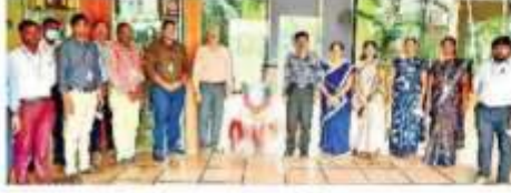
సర్వేపల్లి చిత్రపటానికి నివాళులు అర్పిస్తున్న ప్రిన్సిపల్లులు, అధ్యాపకులు

నారాయణవనం, న్యూస్టుడె: పుత్తూరు సిద్ధార్థ ఇంజనీరింగ్ కళాశాలలో ఉపాధ్యాయ దినోత్సవ వేడుకలు మనంగా జరిగాయి. శనివారం కళాశాల