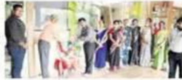
సర్వేపల్లి రాధాకృష్ణ చిత్రపటానికి పూలమాల వేస్తున్న ప్రిన్సిపాల్