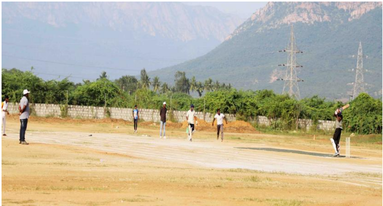
Cricket match between CIVIL dep. and CSIT dept.