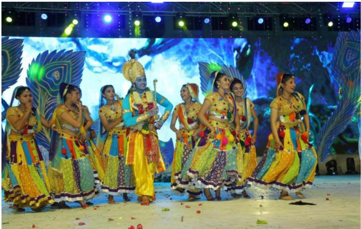
Cultural Program by students