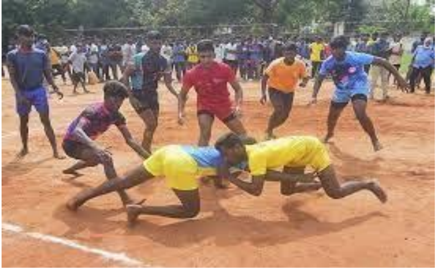
Kabaddi match between CIVIL dept and CSE dept