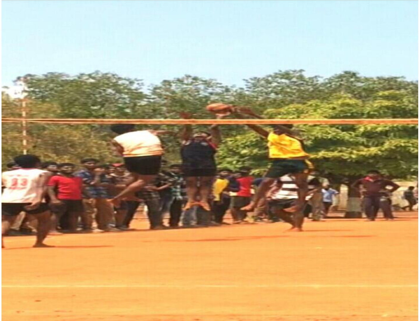
Volleyball match between CSE dept. and ECE dept.