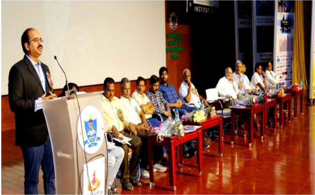
Association event in auditorium and Speech by chief guest