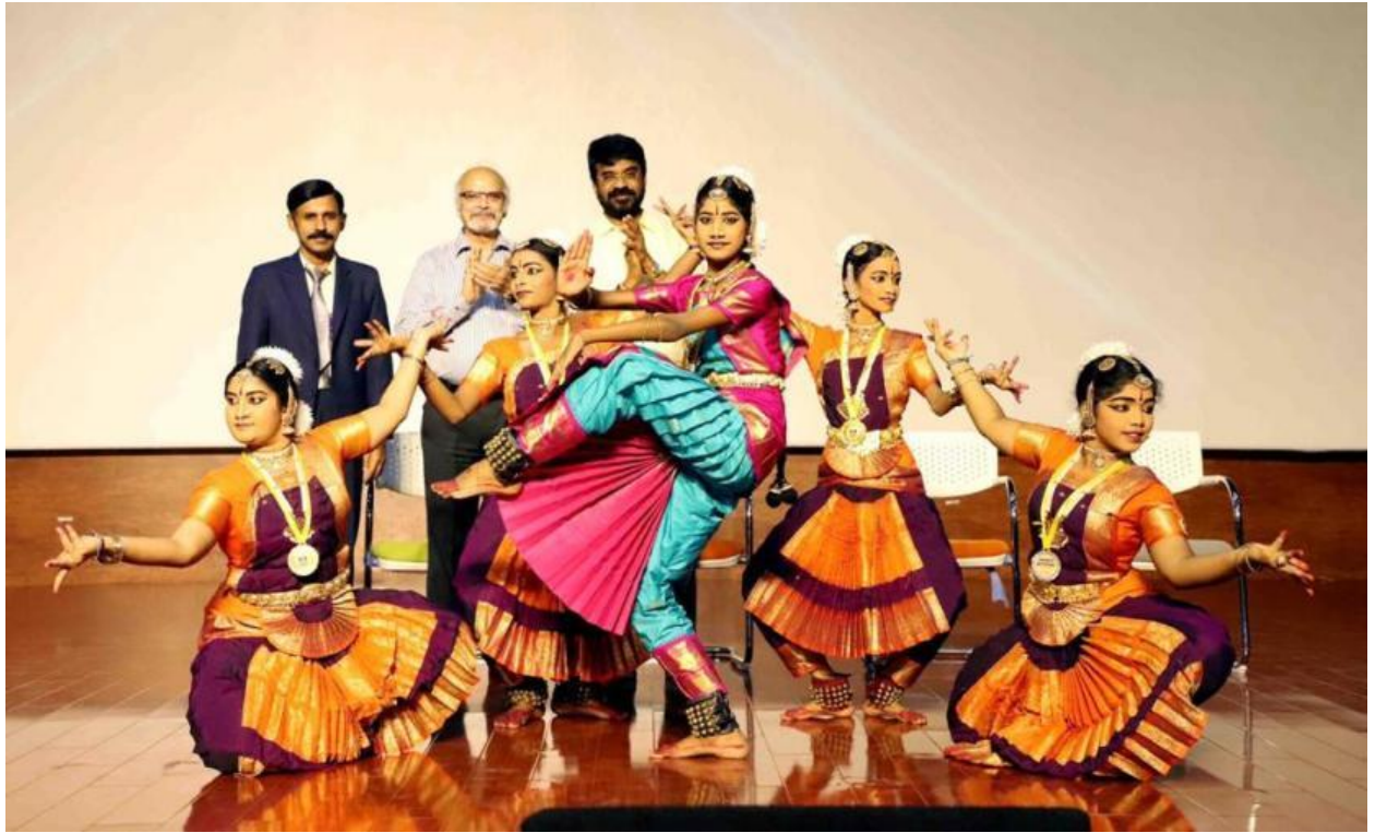
Cultural Program by students on occasion of Women's day celebration