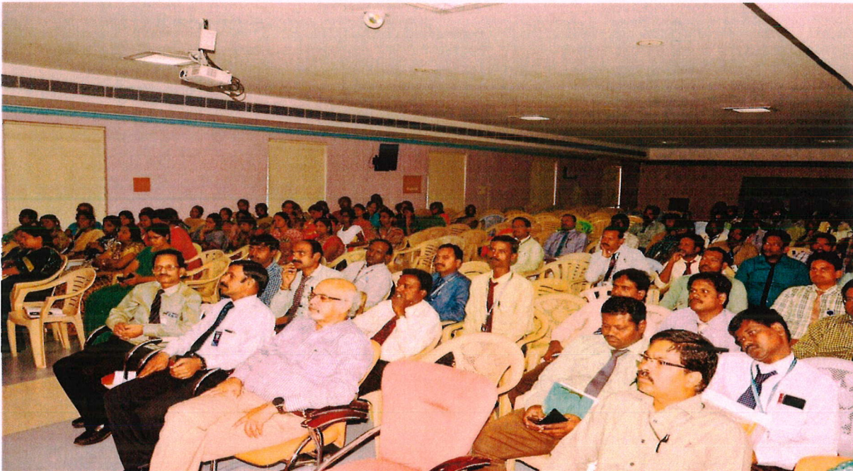
Participants in One Day National Faculty Development Programme on “How to lead professional life successfully” conducted on 03-05-2019