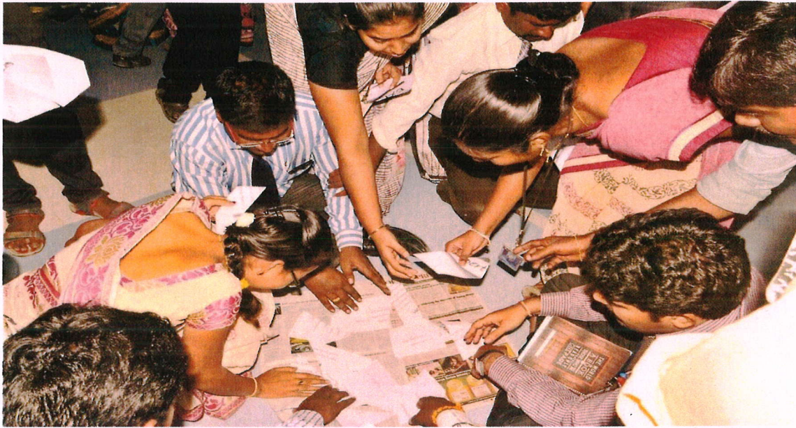
Participants in a class room activity in FDP on Effective Communication Skills in Class Rooms.