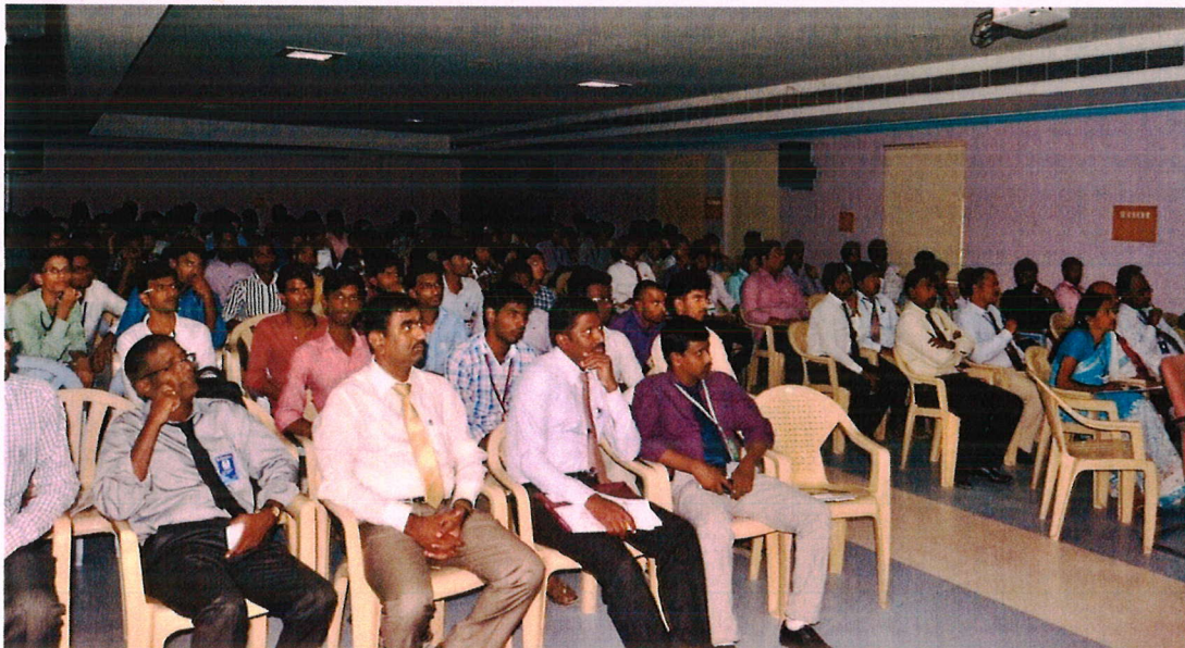
Participants in One Day Workshop on “Curriculum Development” conducted during 8 th and 9 th June 2018.