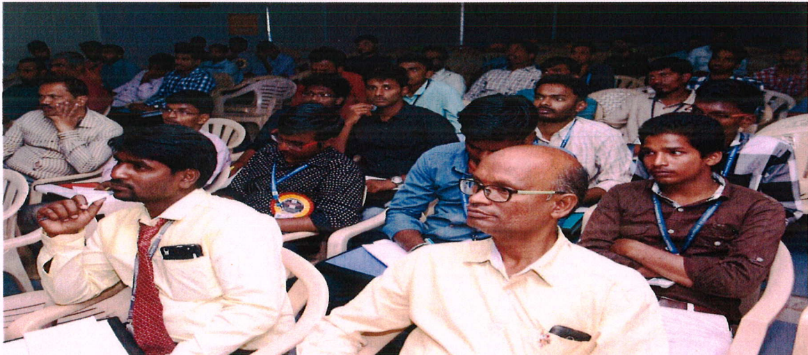
Participants in Faculty Development Programme on "Advanced Teaching Strategies", conducted on 11 th – 12 th MAY 2017.