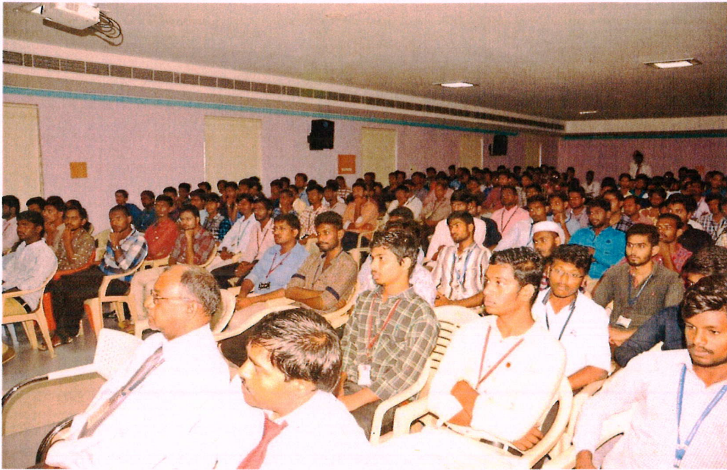
Participants in One Day Workshop on Human Values Organized by Department of Basic Sciences & Humanities, conducted on 21 st April 2019.