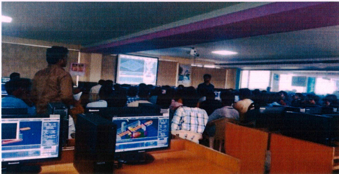
Practice session in Dassault System Lab