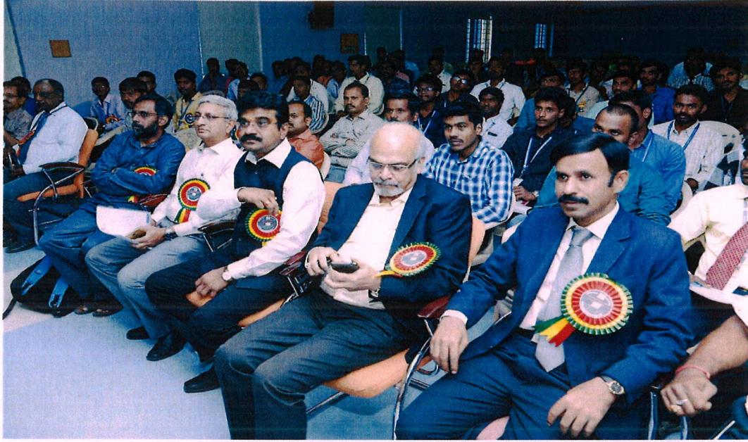
Delegates of one Week Training Programme on "Instructional Design and Delivery System" Organized by Department of Civil Engineering conducted from 11-12-2017 to 15-12-2017.