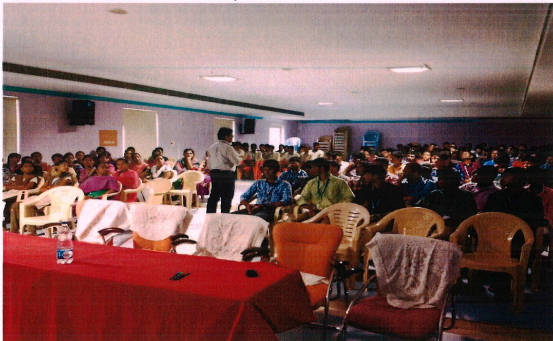
Participants in on Human Values and Professional Ethics, conducted on 13 th February 2018. Leadership Challenges and Classroom Management